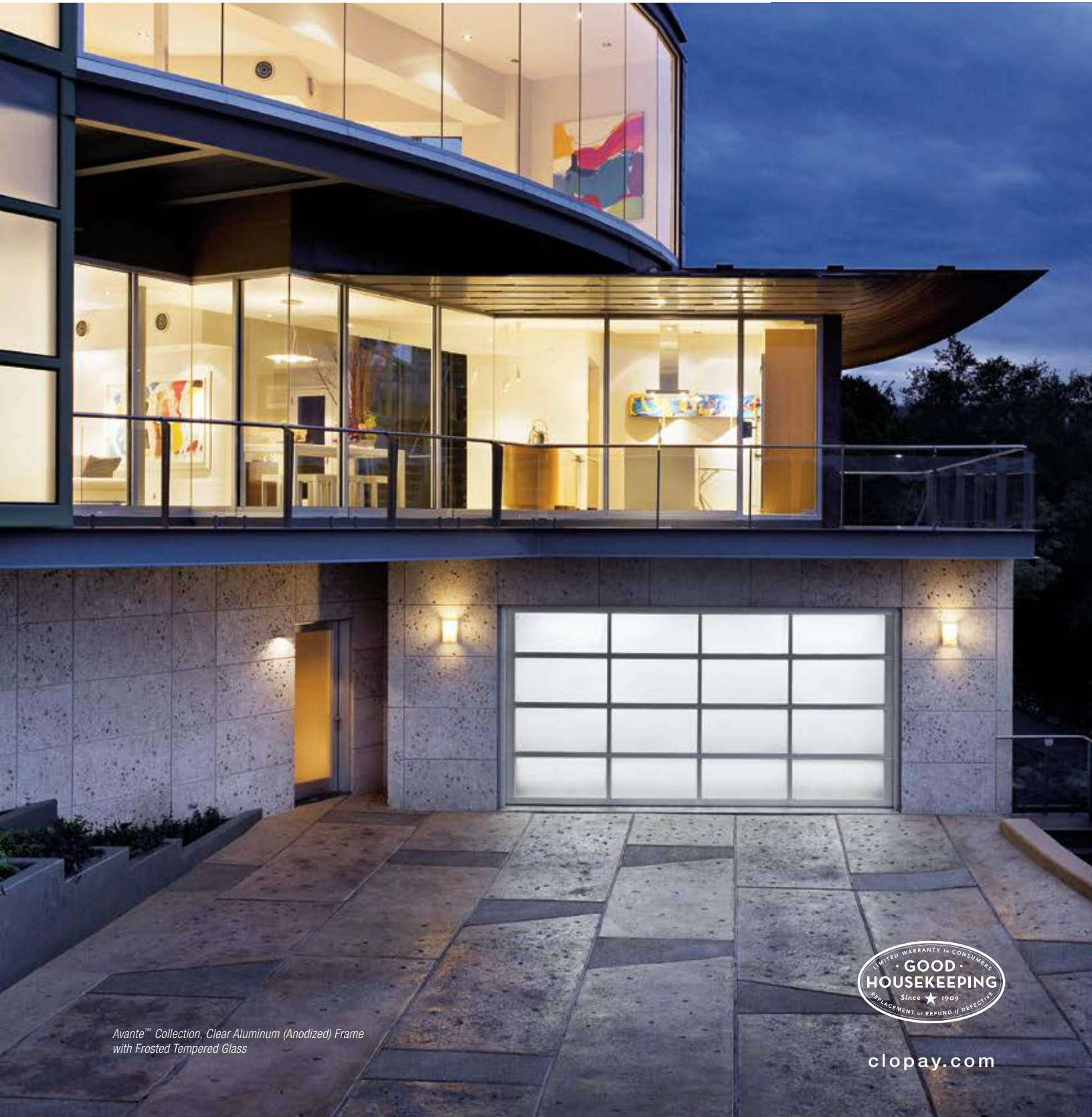
Avante™ Collection, Clear Aluminum (Anodized) Frame with Frosted Tempered Glass