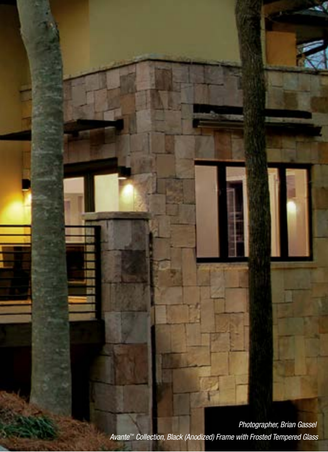
Avante™ Collection, Black (Anodized) Frame with Frosted Tempered Glass