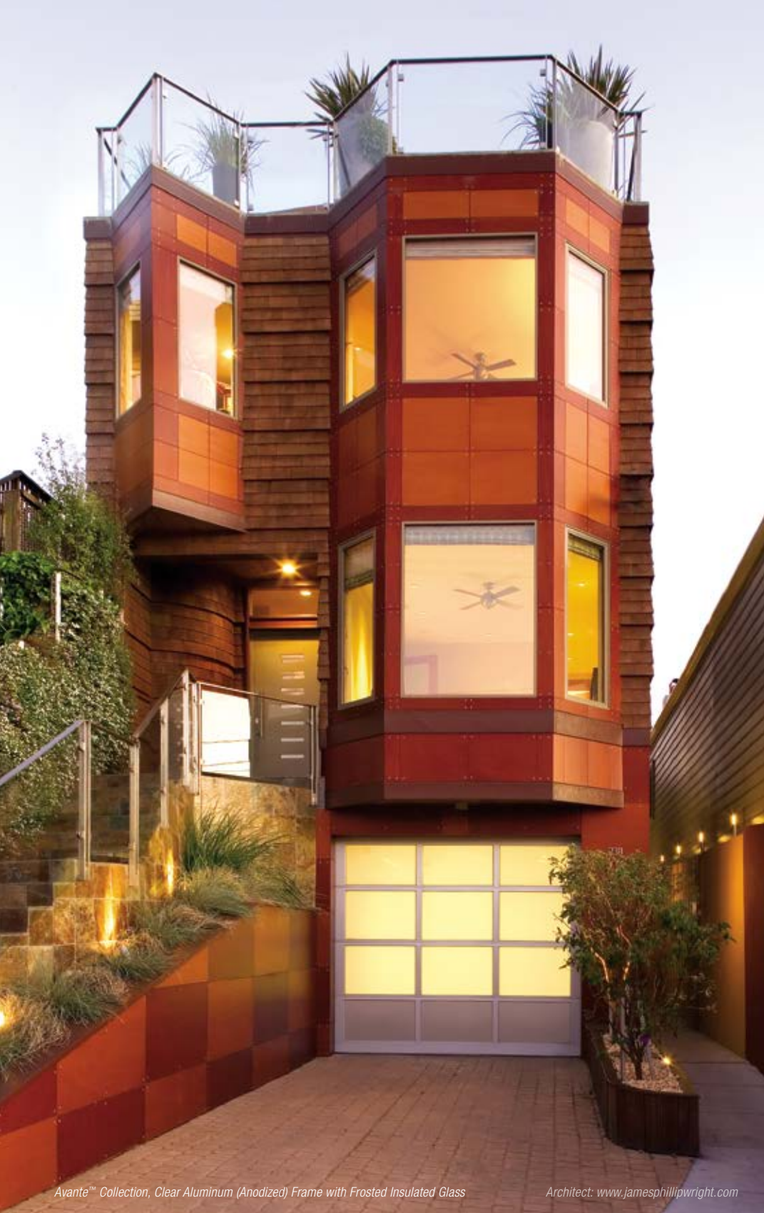
Avante™ Collection, Clear Aluminum (Anodized) Frame with Frosted Insulated Glass