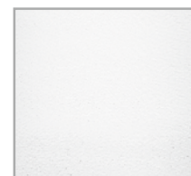
3718 Flush Panel