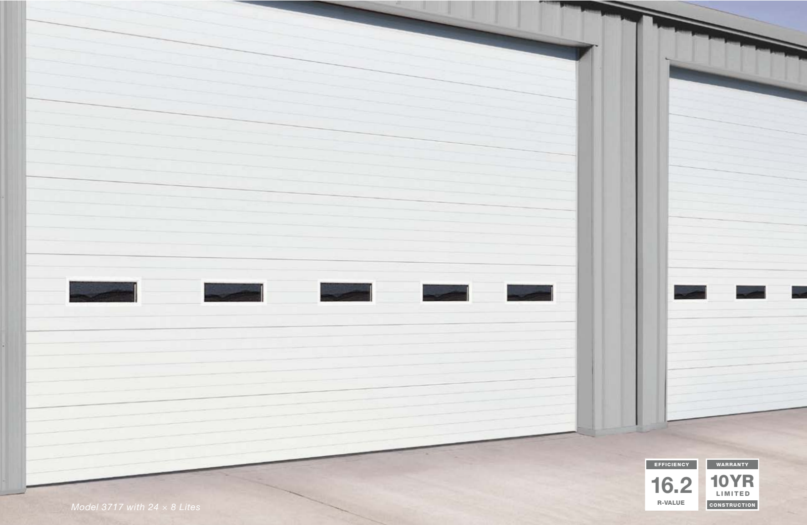
Model 3717 with 24 × 8 Lites