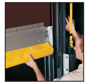
Easily resets, without the need for tools