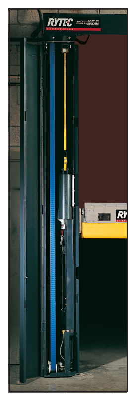
Patented System II independent counterbalance and tensioning system.