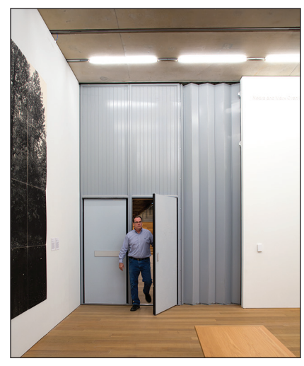
The Safescape® AC8900 combines accordionfolding, mechanically-closing, dual egress with conventional swing door exiting in one assembly – only from McKeon Door!