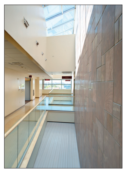
The Model H200 horizontal shutter is used to convert this atrium to a vertical compartment separation, lowering costs by eliminating smoke evacuation systems.