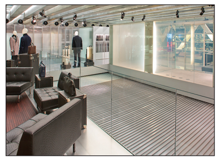
In this hi-profile retail environment, stainless finishes, vertical openings and total fire & life safety compliance are all possible with the McKeon horizontal assembly.